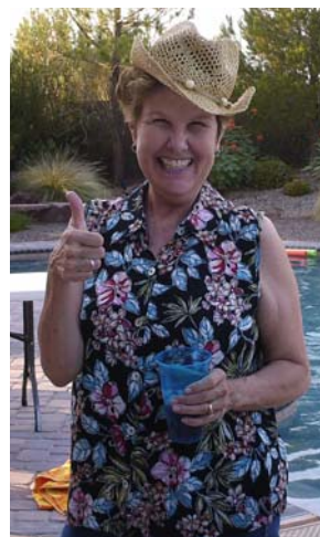
I love that hat!!!!