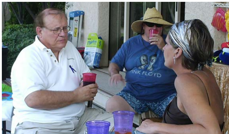
I think we need a moment!