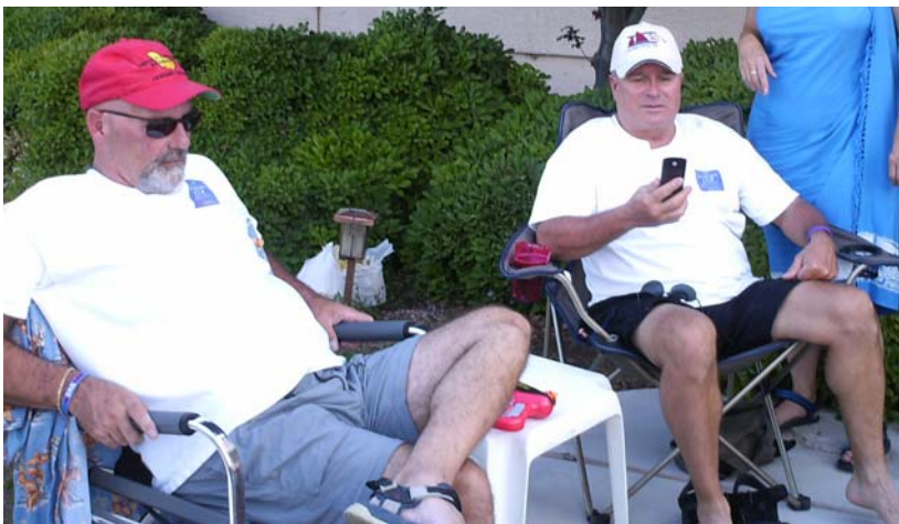
What is it that two presidents can talk about?