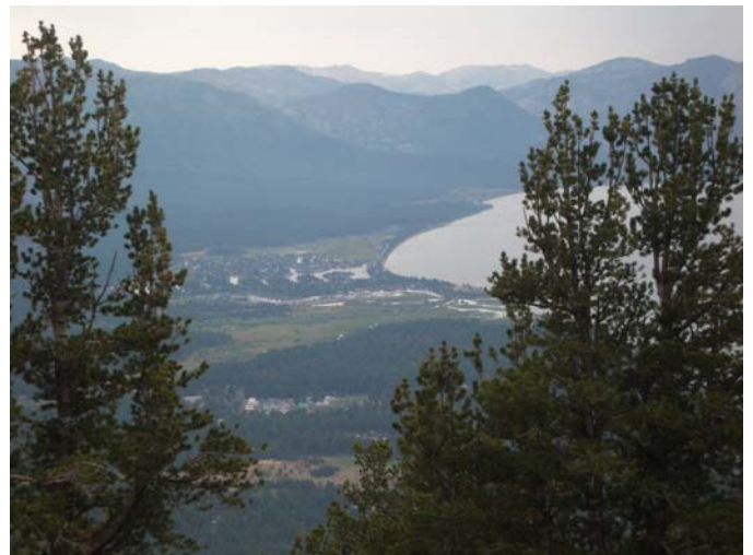
South Lake Tahoe, Keys