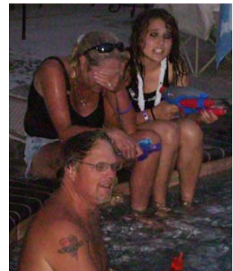
Who started the water fight?